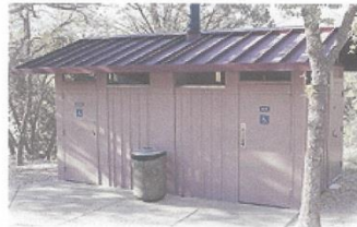
Waterless Restroom Option